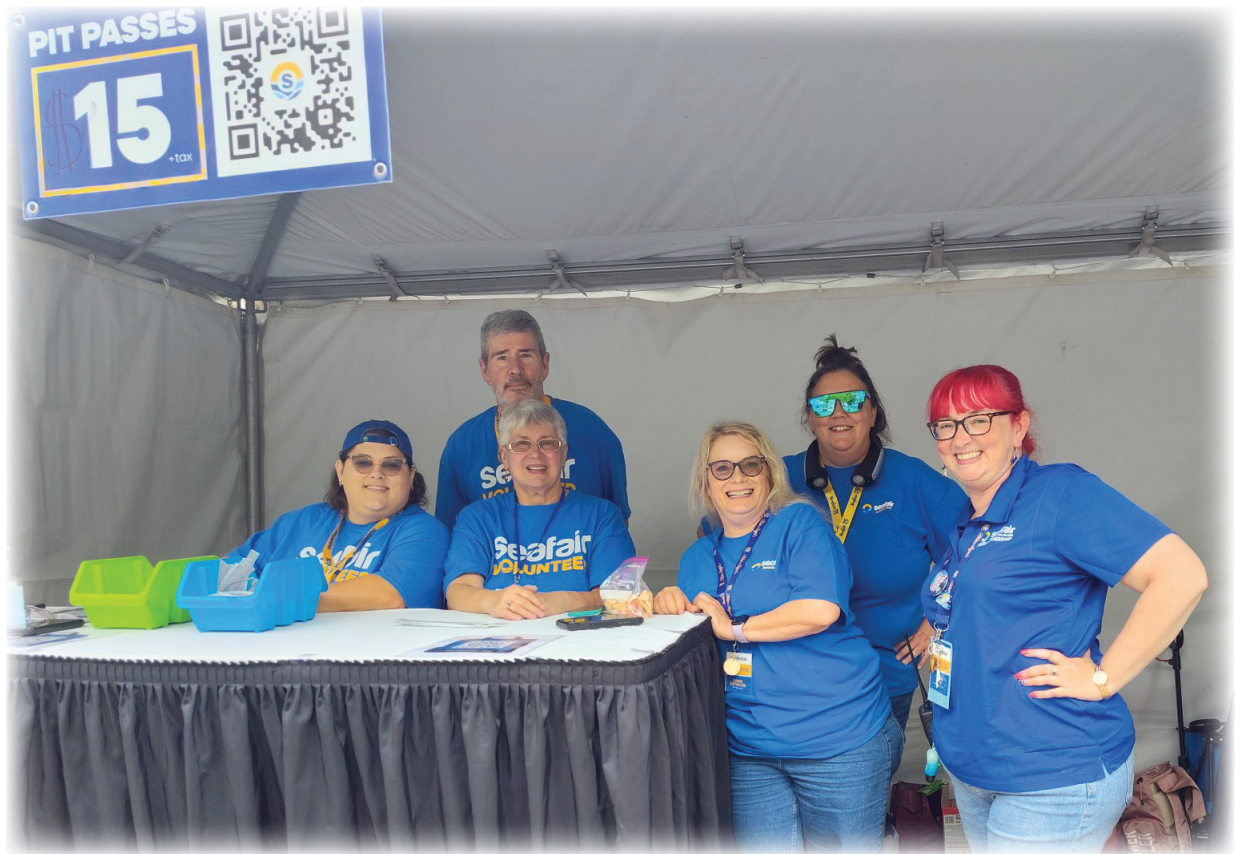
South Sound Sea Hawk volunteers at the Pit Pass Sales booth at Seafair Festival! Weather was perfect!